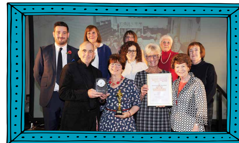
Our volunteers receiving their well-deserved Oscar

The Cone Exchange team were thrilled to receive not one but two awards in the year gone by. The first was at the Harrogate Excellence in Business Awards where we received the Green Business Award (large business) for 'the range of environmentally conscious measures taken by the Cone Exchange, from creating treasure from trash and raising environmental awareness...'